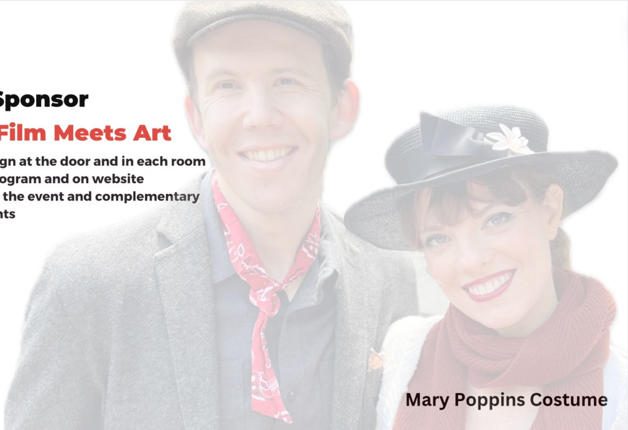
Mary Poppins Costume